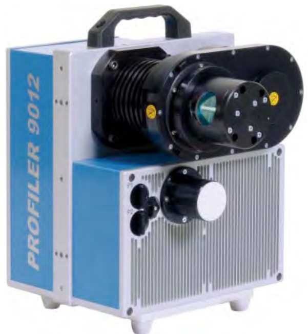
The Z+F PROFILER® 9012

With its high rotation speed of 200Hz, many details are recorded very quickly and accurately, even at higher speeds of the carrier platform.