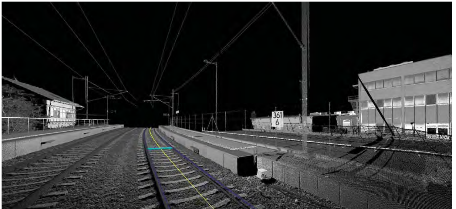
Point cloud of a track in Switzerland, scanned with the Z+F PROFILER® 9012. The data can be used to measure tracks and to carry out interference checks.