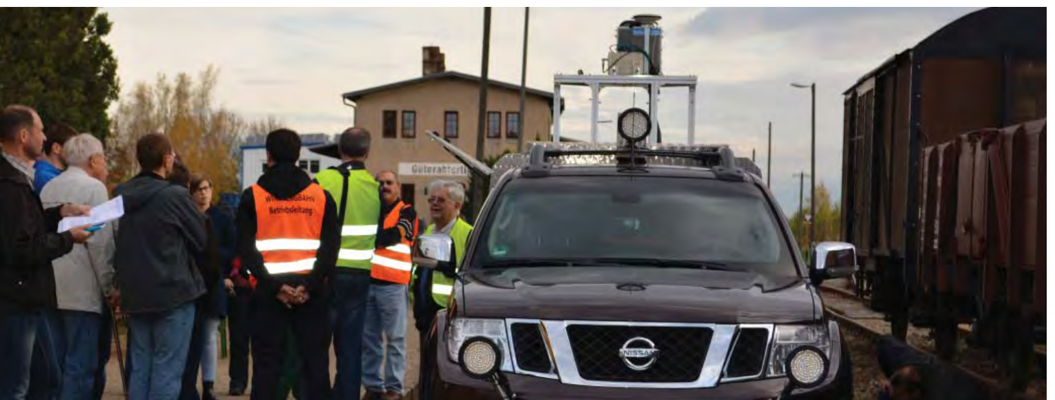
The RailMapper, equipped with a Z+F PROFILER® 9012, is being viewed by an interested group of experts.