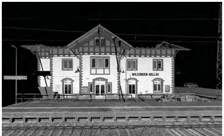
Point cloud of a railway station in Switzerland, scanned with a Z+F PROFILER® 9012.

The results of the Windbergbahn measuring run were processed by students of HTW Dresden. The captured data can be used for measuring clearance gauges, examining the track’s positions, calculating 3D profiles, creating digital models of the surrounding areas and carrying out interference checks.