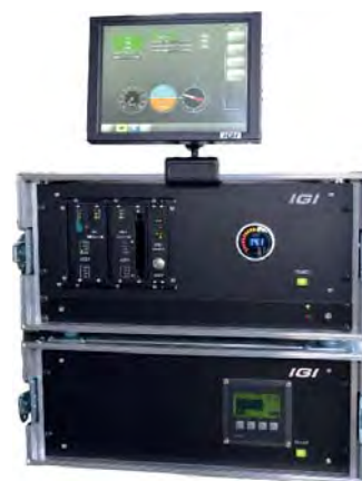
IGI Mobile Mapping control unit with uninterruptable power supply.