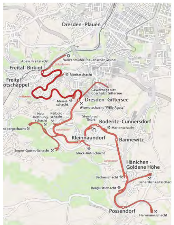
Map of the rail network