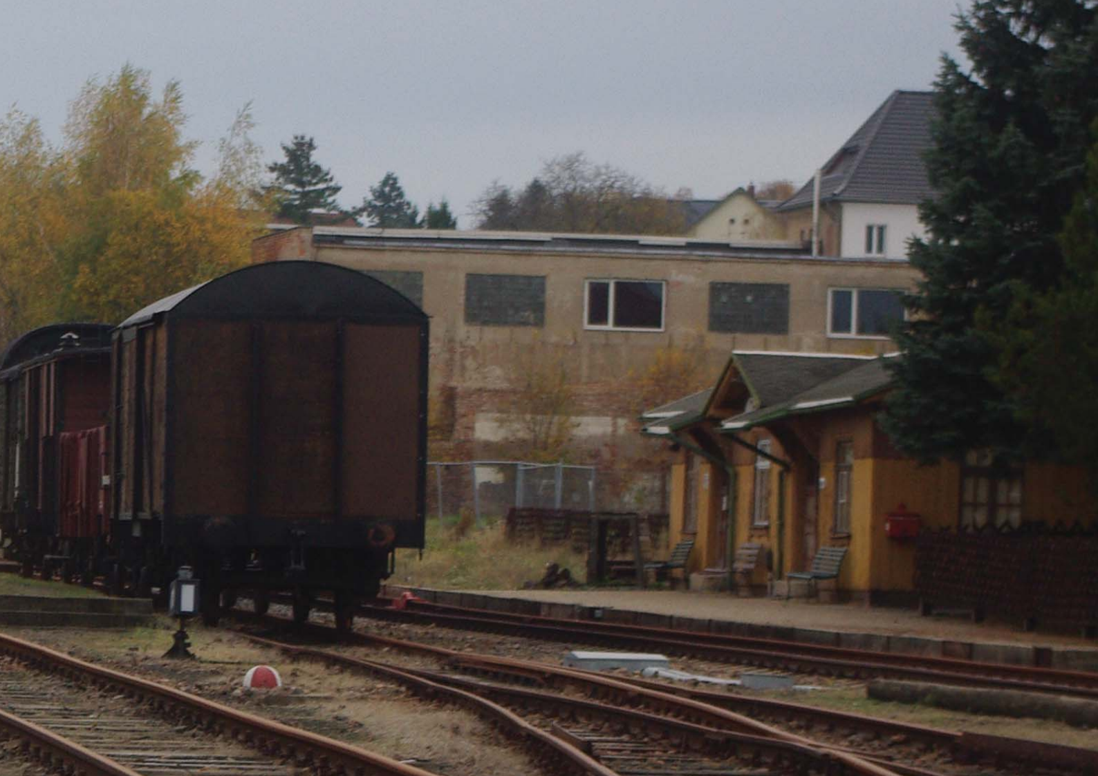
During the survey: IGI's RailMapper