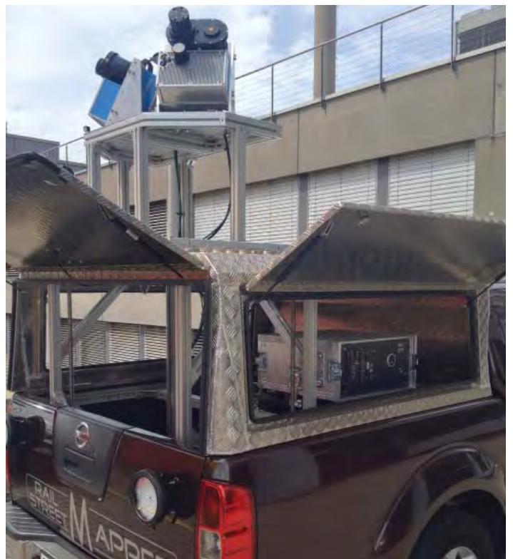
The RailMapper with two Z-F PROFILER® 9012

Every system consists of IGI's GNSS/IMU based positioning system of the type as well as TERRAcontrol, delivering the best accuracies available and making the solution successful.